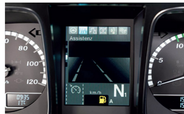
Lane keeping Assist & Attention Assist are standard on Arocs Distribution Vehicles.