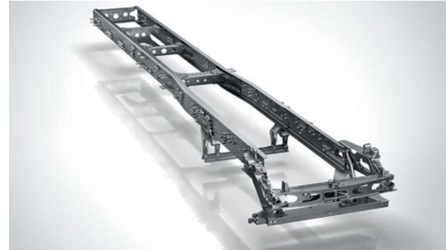
Modular Layout of the chassis allows for easier body mounting.