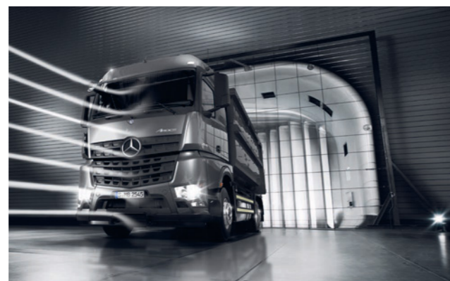
Low drag and rolling resistance. The design contributes to a low level of aerodynamic drag and thus to reduced fuel consumption.