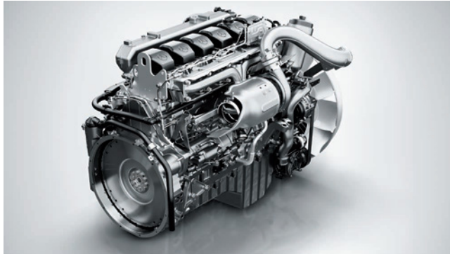
The reliable and durable design of the OM460 features particular robust technology such as unit pump-line injectors.