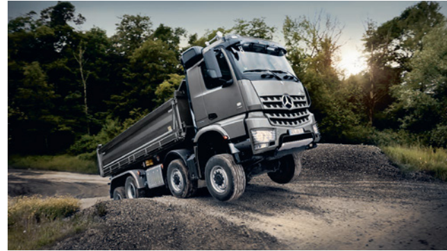
Robust planetary axles for off-road operation.